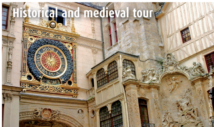
Historical and medieval tour