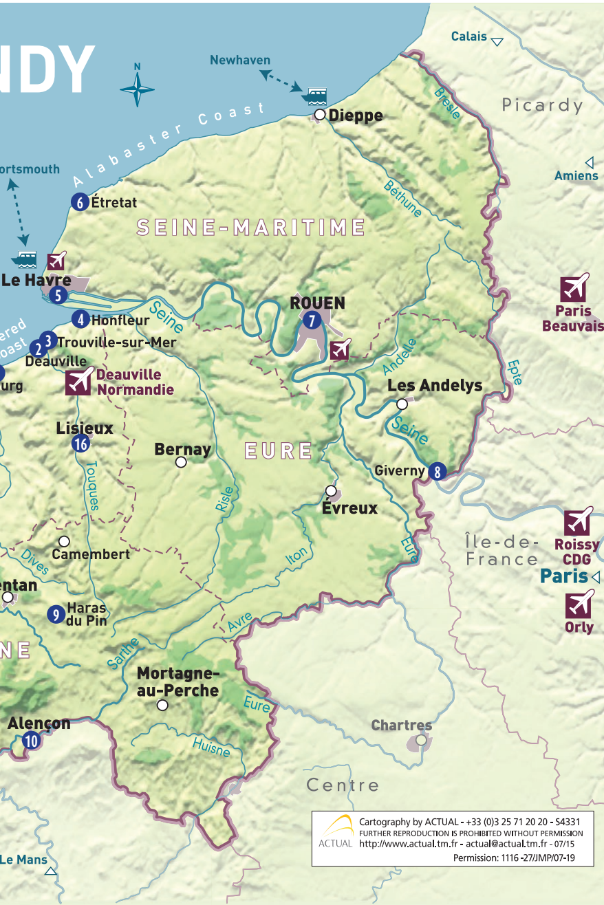
Les Haras du Pin - Olli Onne

Cartography by ACTUAL - +33 (0)3 25 71 20 20 - S4331 FURTHER REPRODUCTION IS PROHIBITED WITHOUT PERMISSION http://www.actual.tm.fr - actual@actual.tm.fr - 07/15 Permission: 1116-27/JMP/07-19